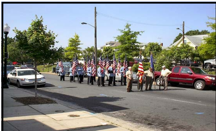
Memorial Day with Post 109